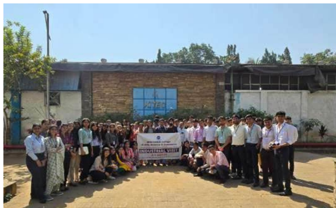
Industry visit to KiTECH in Silvasa was organized for all FY students.