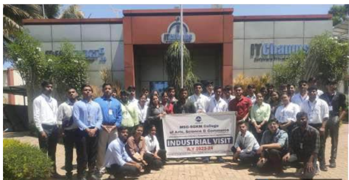
Industry visit to ITChamps Software Limited in Mysuru, Karnataka was organized for BSC-IT and BSC-CS students.