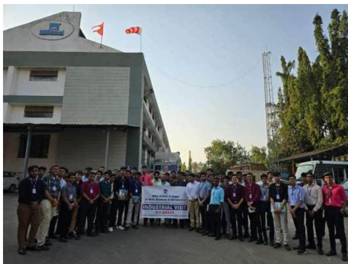
Industry visit to Nilkamal in Silvasa was organized for all FY students.