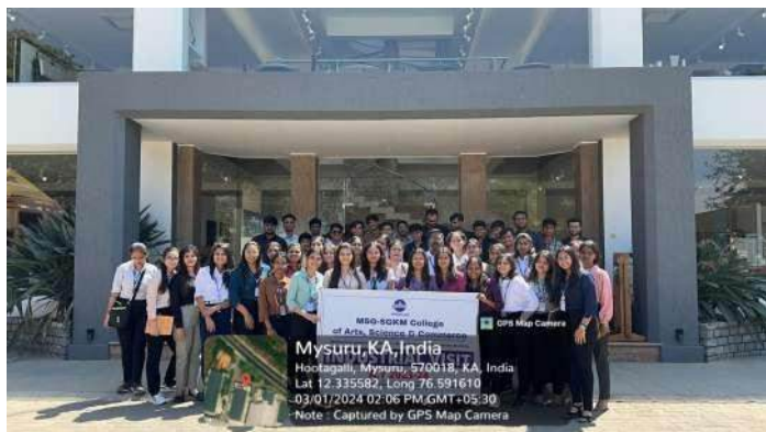
Industry visit to Vagh Group (Masfurniture) in Mysuru, Karnataka was organized for BMS and BAF students.