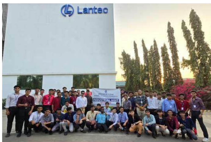
Industry visit to Lantec in Silvasa was organized for all FY Students.