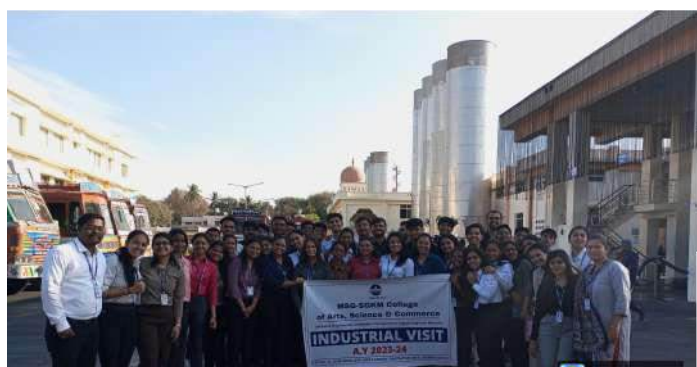
Industry visit to Nandini Dairy in Mysuru, Karnataka was organized for BMS and BAF students.